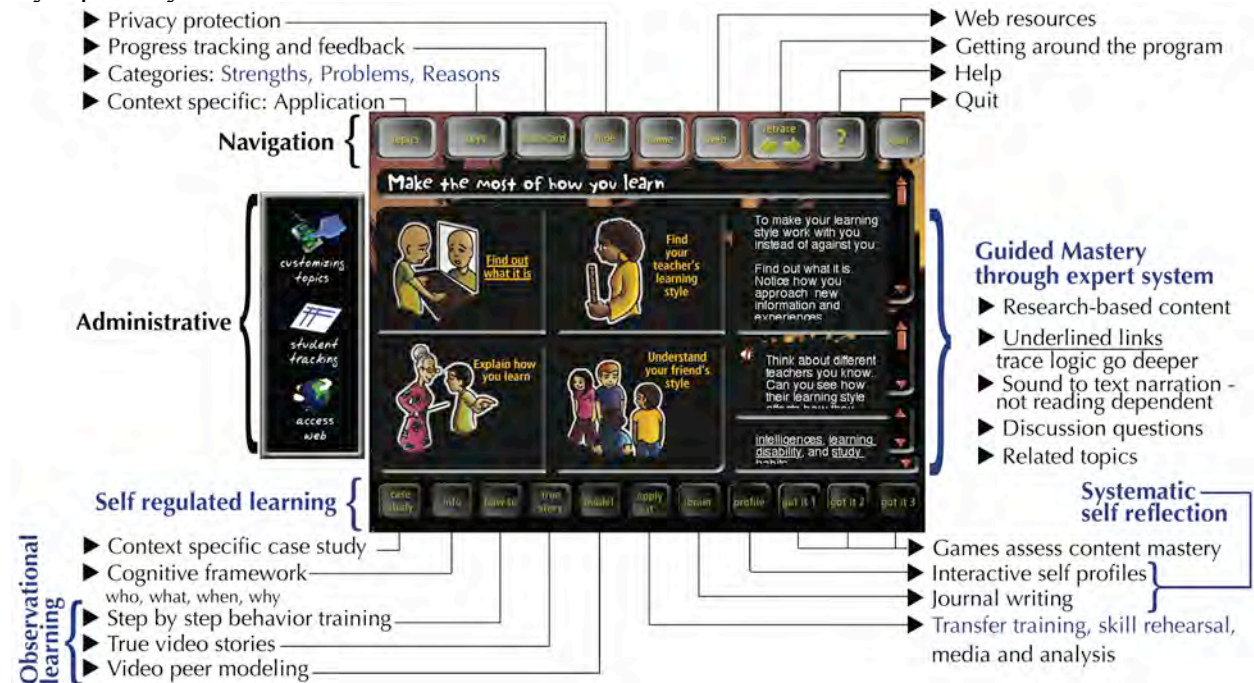
Figure 2: Diagram of the Whole Spectrum Self-Regulated Learning System

Learning process. Independent of specific content, the Whole Spectrum Self-Regulated Learning System that powers Ripple Effects SEL software (Figure 2) contains elements that have been linked to successful development of self-efficacy: guided mastery, self-regulated learning, observational learning, systematic self-reflection, transfer training, and skill rehearsal (Bandura, 1997; Pajares & Urdan, 2006). All of these modes of learning are introduced with a case study scenario (context-specific application). Additional elements of the system include continuous assessment of content mastery through interactive games; reading independence through peer narration and illustrations; narrative/story as teaching tool, including first person video true stories; and, positive reinforcement for completion of the learning process through a video game style point system.